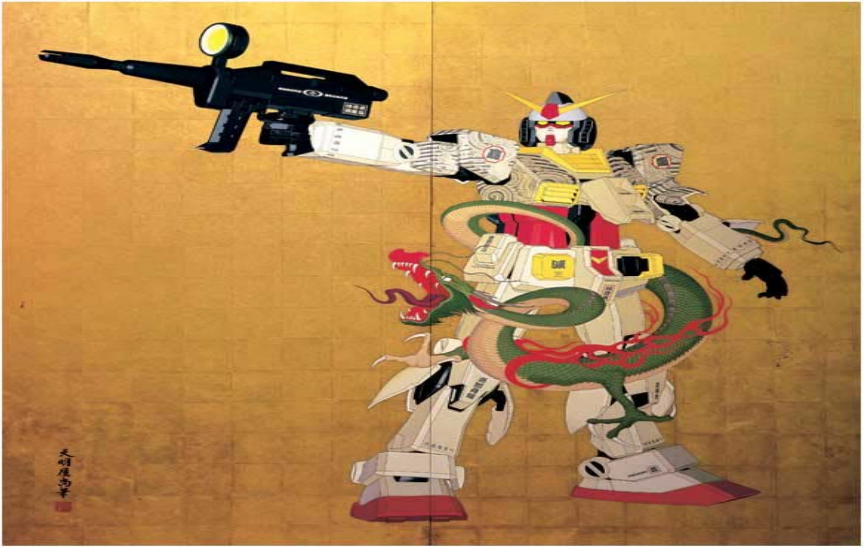
Category 3, Question 6, Traditional/Contemporary Japan, a Geek in Japan, pg. 122