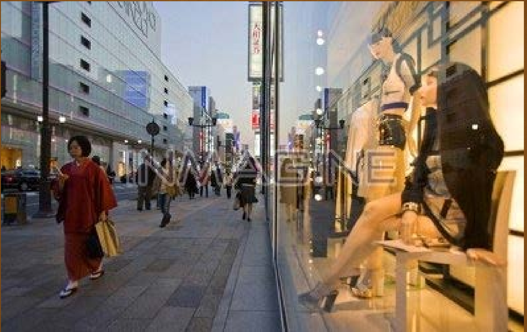
Category 1, Question 2, Cultural Change, Tokyo Megacity, pg. 88