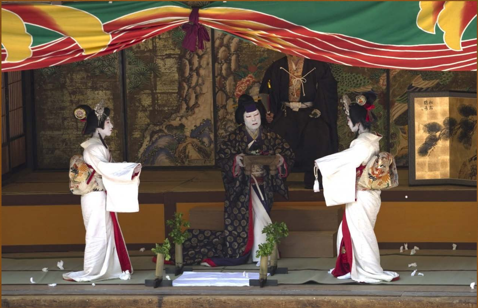
68 Category 5 Question 9, Role of arts in Japanese culture, a Geek Japan, pg. 29