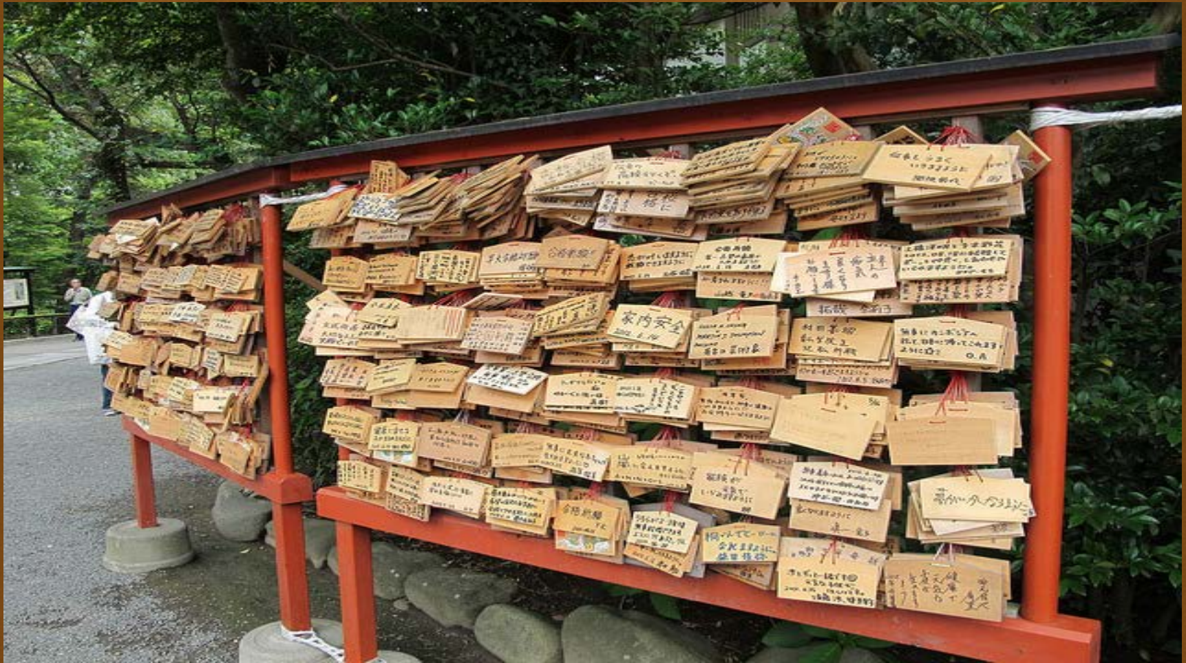
Category 5, Question 10, Japanese Identity 21st century, Walking Pilgrimage.