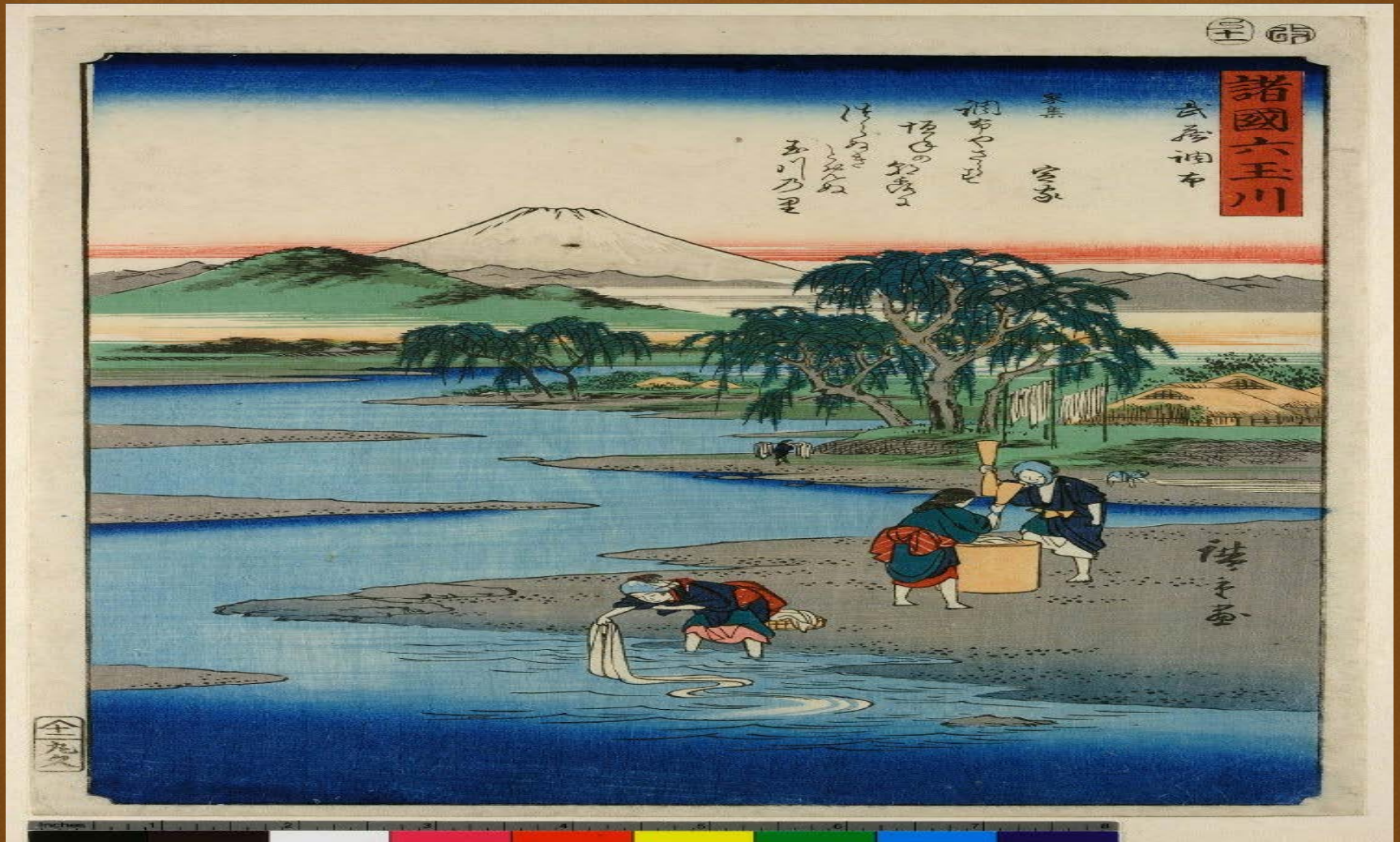
Category 3, Question 5, Visual Resources in Japan, a Geek in Japan, pg. 101