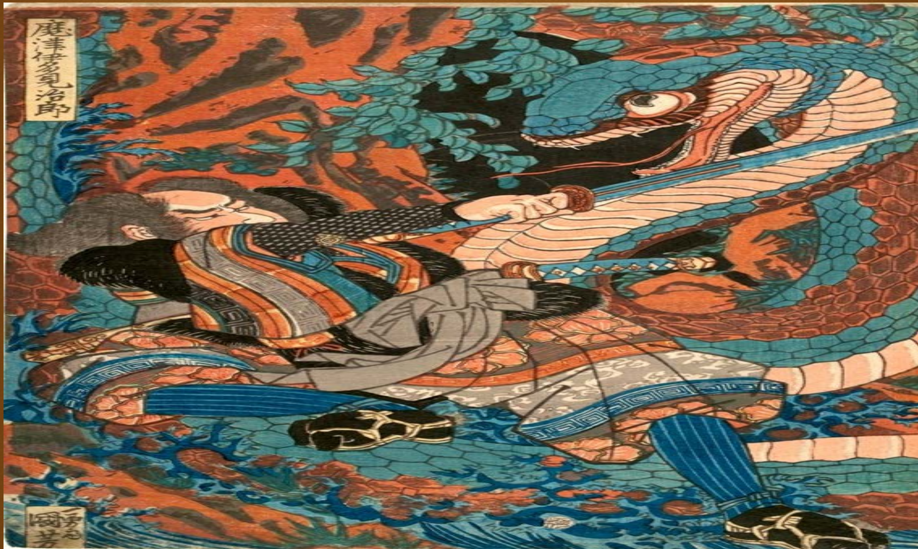
Category 3, Question 6, Traditional/Contemporary Japan, a Geek in Japan, pg. 15