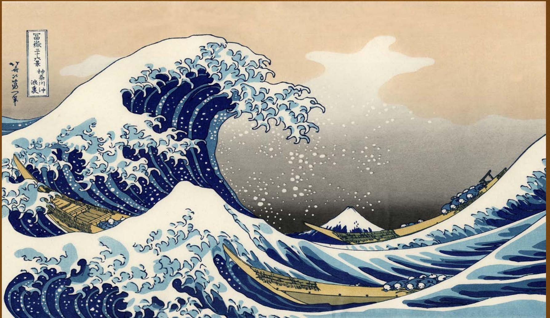
Category 4, Question 7, Aesthetic elements of Japanese Art, a Geek in Japan, pg. 27