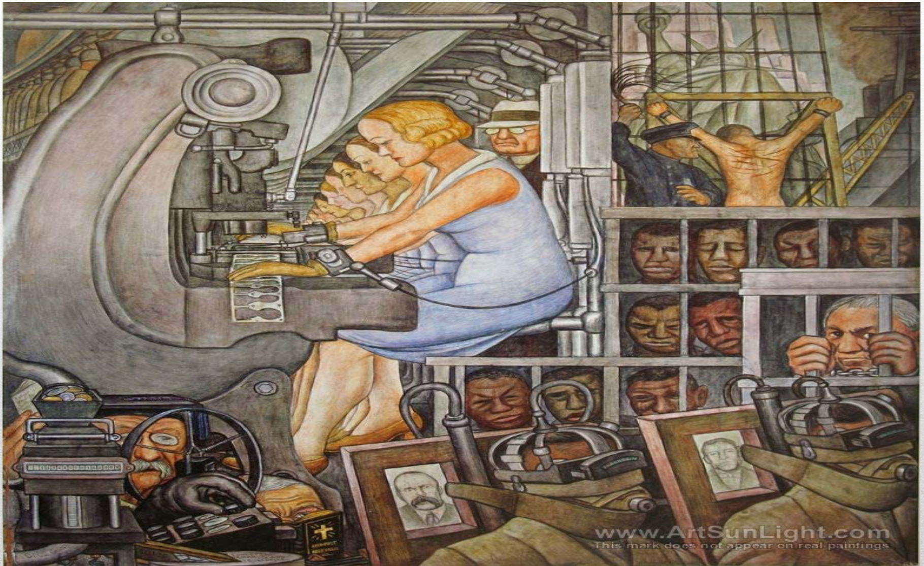
The New Freedoms (Portrait of America)