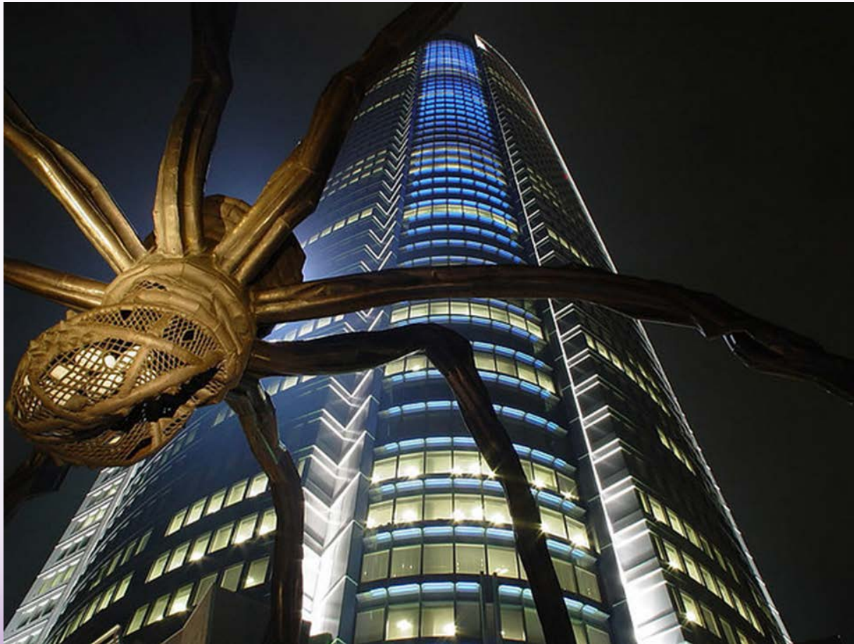
Pg. 126, Modern Tokyo