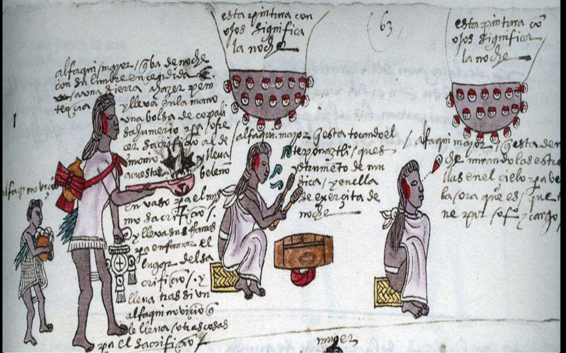
Nightly duties for Aztec priests. Nd.