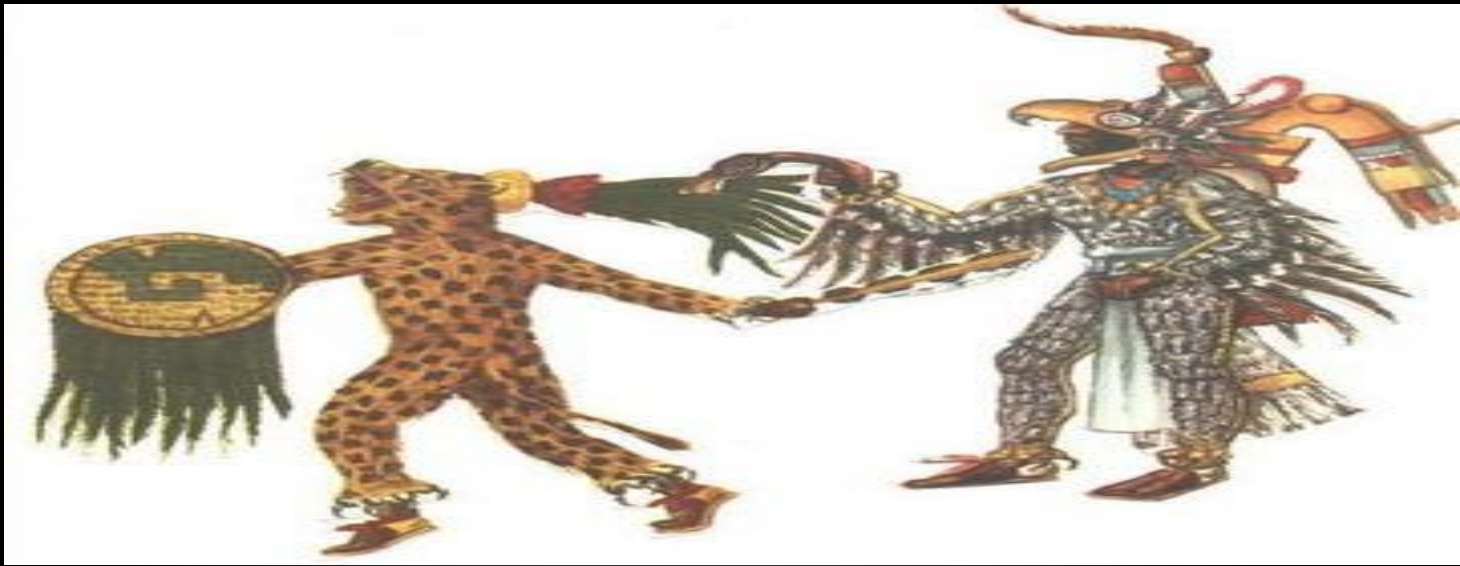
Unknown. Military. Mexica History: Aztlán Uprising. Nd