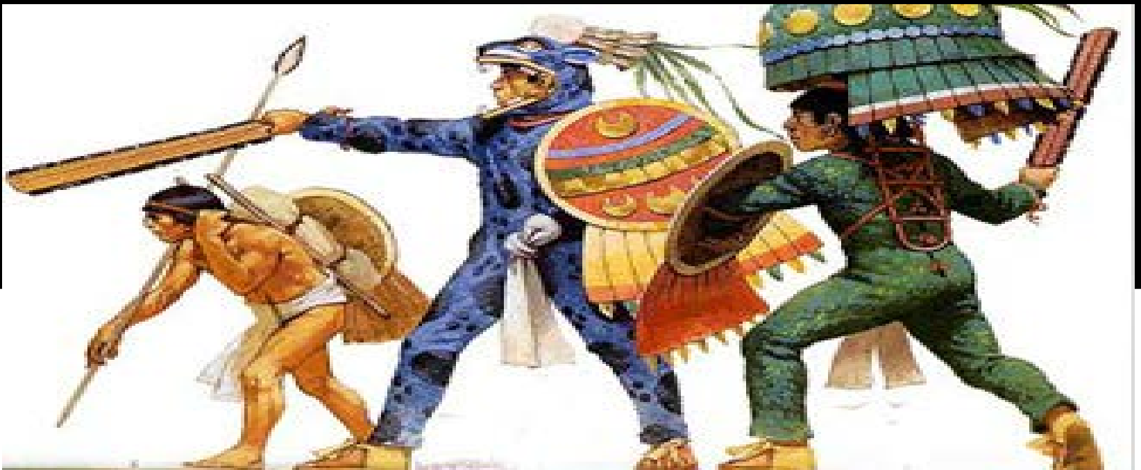
Aztec Warrior , Ancient Aztec military, 2010